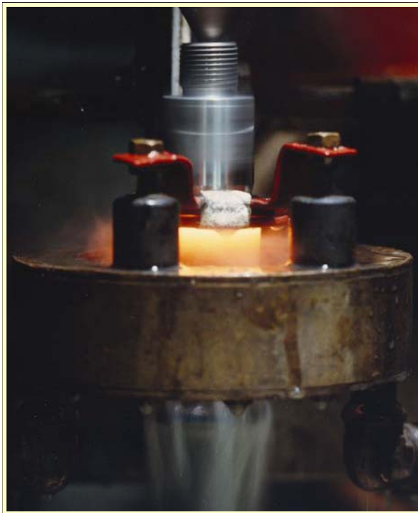
Induction Hardening Capabilities