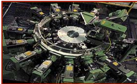
Rotary Transfer Capabilities